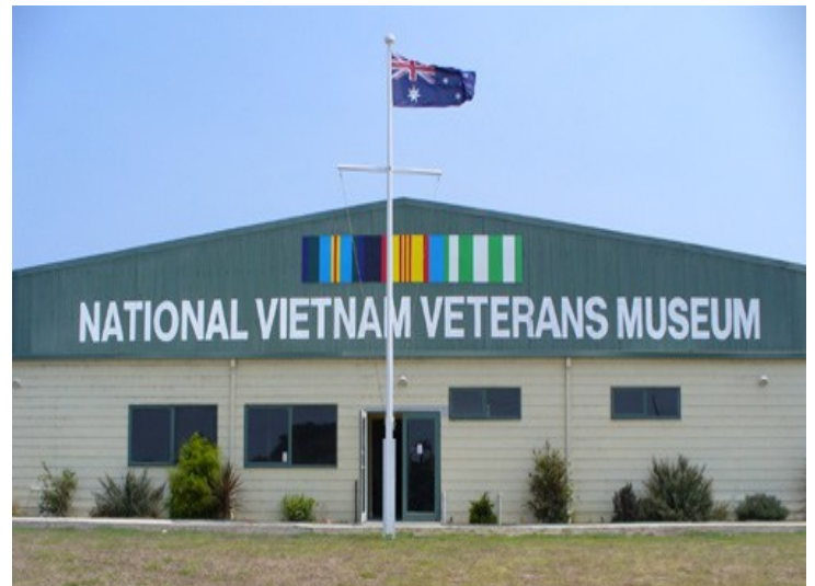
Picture of the Museum at the time it was officially opened by the Victorian Premier The Hon Steve Bracks MP on Friday 9 March 2007.

Why not call in to the Museum and see the new look and the vast array of exhibits.