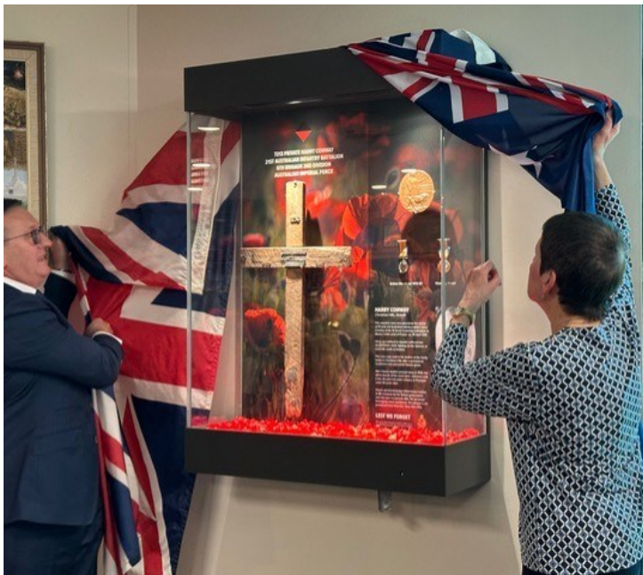
Cross unveiled by family members.