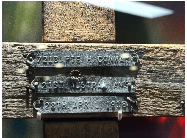
Metal ID markers on the Conway Cross.